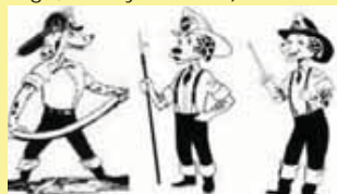
1950's 1960's 1970's

Sparky sure has come a long way since 1951. Take a look at how he's changed over the years! (He's gotten cuter with age, don't you think?)