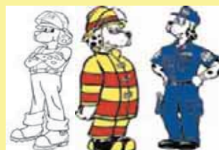
1980's 2000 Now!!

Wildland fire season has arrived or will soon arrive with the melting of the snow. Historically, spring fire season in April and May is the most active time for wildland fires. Fine dead fuels in the form of dead grass, dead brush, and small branches and limbs ignite easily and spread quickly. This is also the time of year when folks are cleaning up their yards and making burn piles.